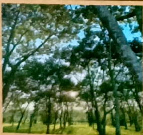
KASTURI BORGUHAIN (2 ND SEM)