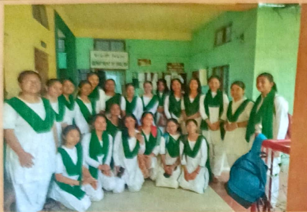
PREPARED BY THE 4 TH SEMESTER STUDENTS