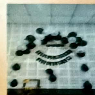
Department Fresher's 2023