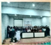
One day workshop on Spoken English 2024