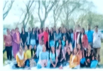
English & Geography department's joint picnic