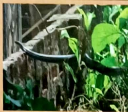
SIMRAN GHOSH (4 TH SEM)