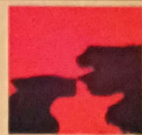
SIMRAN GHOSH (4 TH SEM)