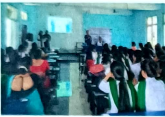
Annual Lecture Series