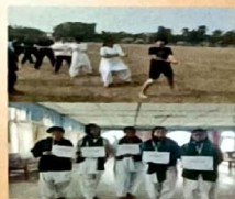
English Department students won 3 rd prize in TUG OF WAR (college week 23-24)