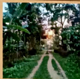
EMON GOGOI (4 TH SEM)