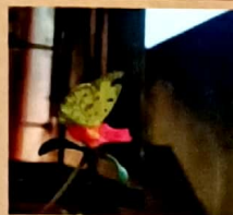
ANANYA GOSWAMI (4 TH SEM)