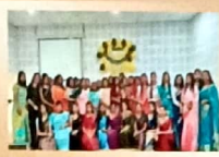
Department Farewell 2024