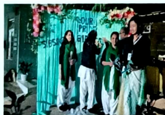
Talented students from English department are helping in the preparation of Alumnae Meet