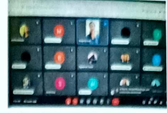
PROJECT STIMULUS: Alumnae from English department have been continuously counselling their juniors on how to qualify CUET for taking admission in MA English under central universities