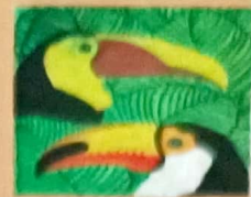
SANTIYA SULTANA (3 RD SEM)