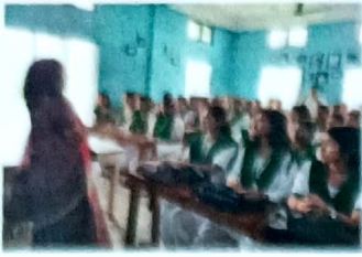
NAAC Peer Team Member's interaction with English major students